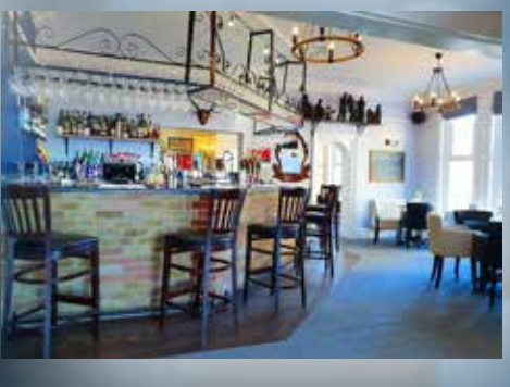
WEST BAY SUITE & BAR