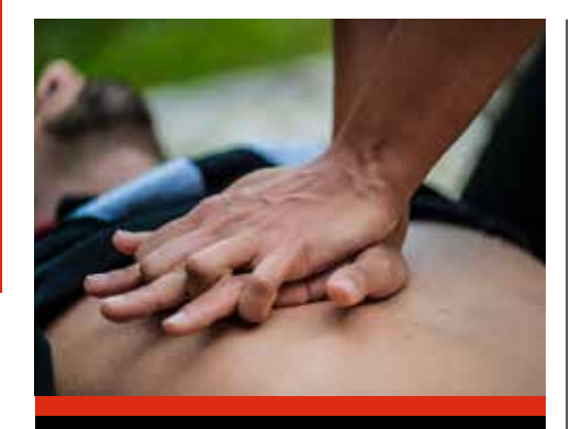
CPR & DEFIBRILLATOR TRAINING Wednesday 30th October 7pm-9pm