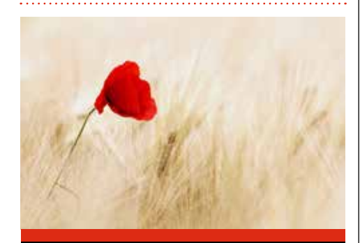
REMEMBRANCE SERVICES AND PARADE Sunday 10th November 10:30am – 12:30pm

Westgate-on-Sea Town Council Offices, 78 St Mildreds Road, Westgate-on-Sea, CT8 8RF