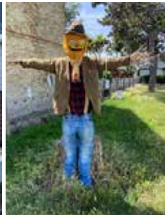
Best Traditional Scarecrow