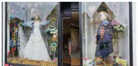
Best Scarecrow Shop Window Display

Winners – St Crispins School, Purple Bubble for Harry Potter