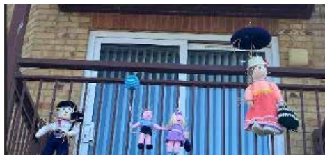
Most Skilfully Crafted Scarecrows