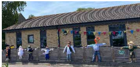
Best Scarecrow Created by a Young Person