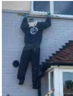
Most Humorous Scarecrow